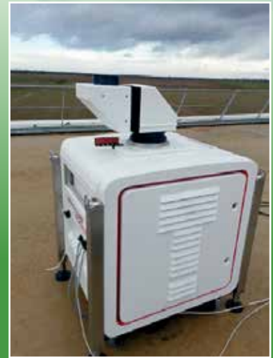
New Generation Electronic-Scanning Solid-State X-band Radar and High-Power Laser 3D Scanner 1.5 \mu\text{m} Lidar (Toulouse Airport trials)