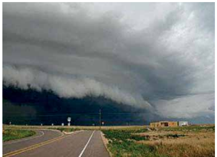
WIND SHEAR OF CONVECTIVE STORM