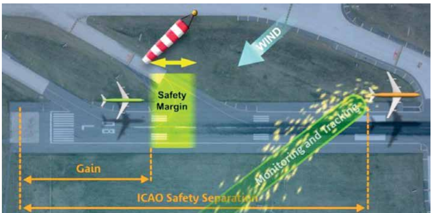
SAFE MARGIN GAIN REDUCTION OF AIRCRAFT WAKE-VORTEX SEPARATION BY ULTRA-FAST WIND AND WAKE-VORTEX MONITORING