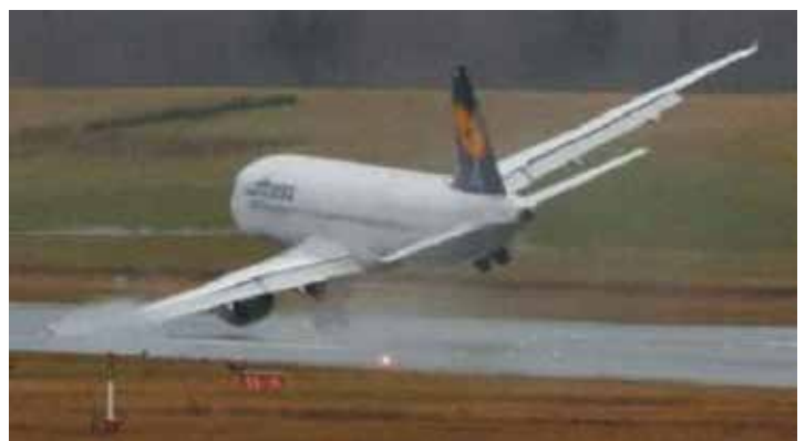
CRITICAL AIRCRAFT ROLL ANGLE AT LOW ALTITUDE IN CASE OF WIND HAZARDS ENCOUNTERS